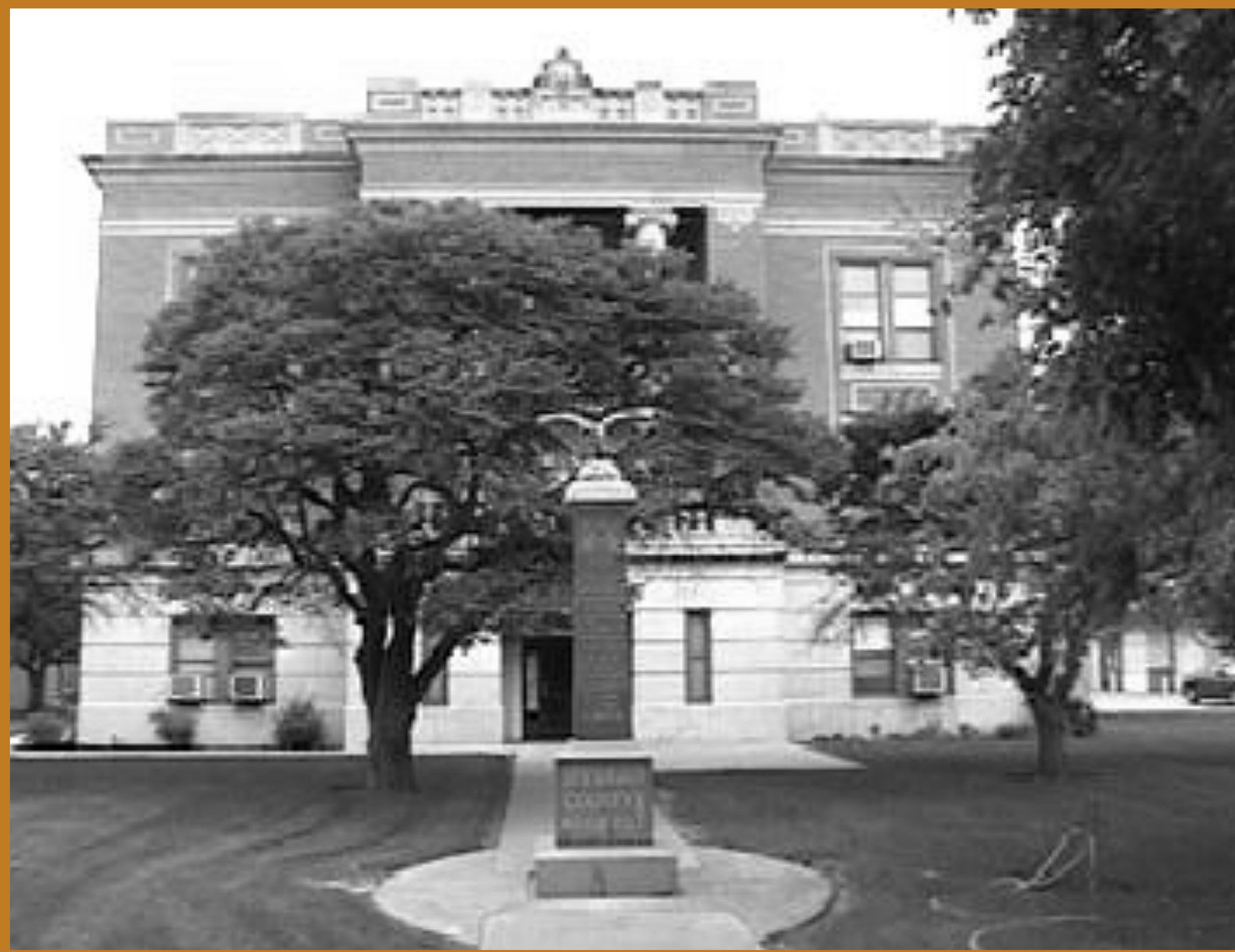
The 1897 Sheridan County Courthouse is an architectural gem.

The Hoxie Grade School and First Presbyterian Church also boast beautiful designs, and were built in the early 1920s. Both of these buildings are still used today.