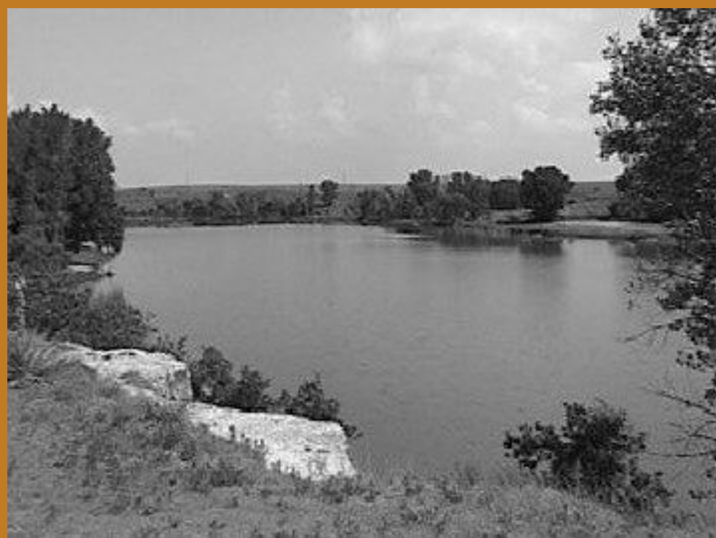
Sheridan State Fishing Lake

Think Hoxie has always been the county seat? Well, think again. While it is currently the county seat of Sheridan County, it originally was not and only became so after the community moved from the settlement of Kenneth. It was moved a couple of miles north of Hoxie, to be near the railroad when it was in use. They moved the town with teams of mules and horses in 1886. You can find more information about the early days of establishment at Mickey's Museum, located on U.S. Highway 24. The museum is operated by the Sheridan County Historical Society and covers generations of history through household articles, clothing, photographs, farming tools and much more.