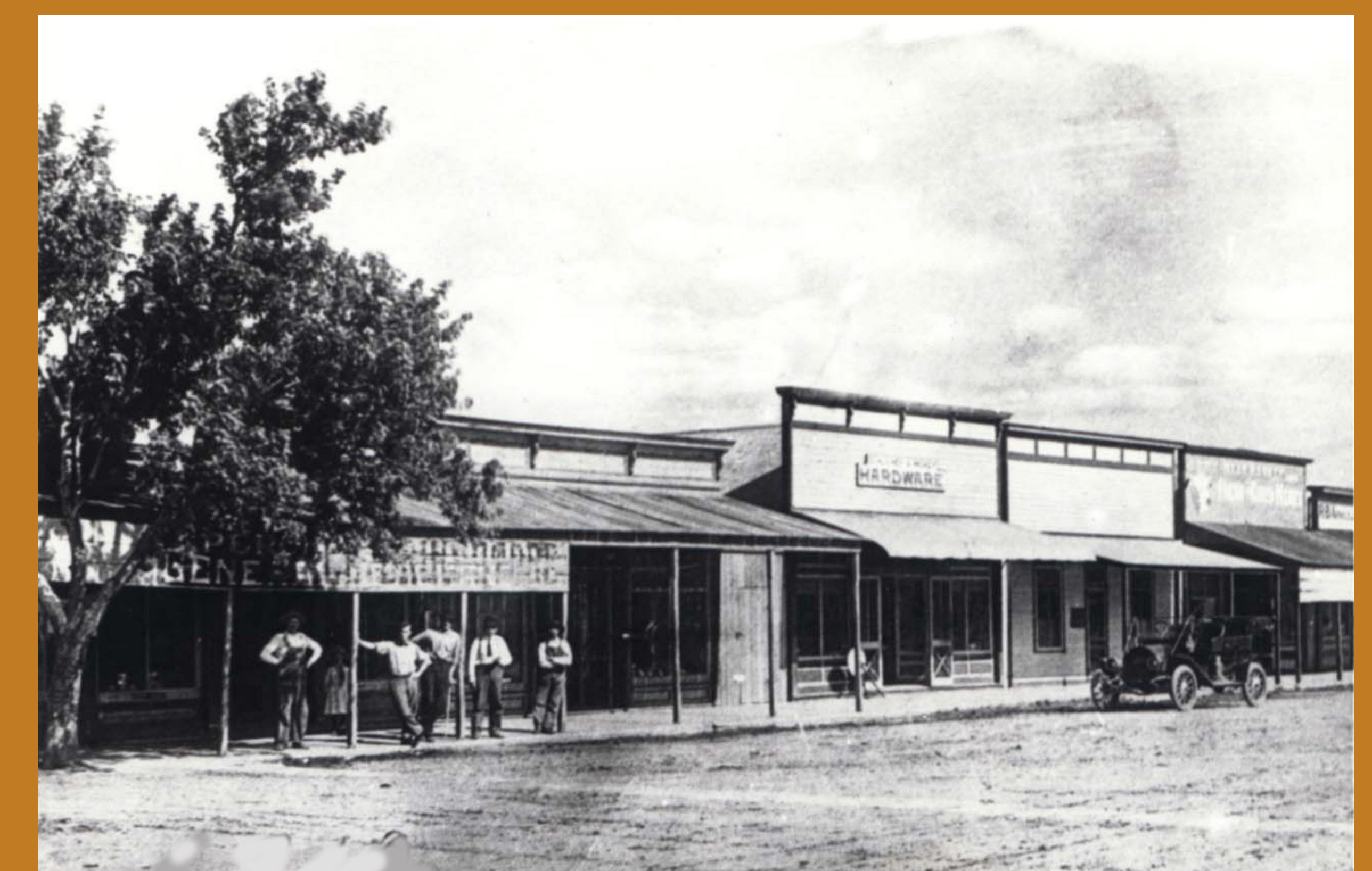
Main Street in Hoxie looked much different in this photo from 1910.