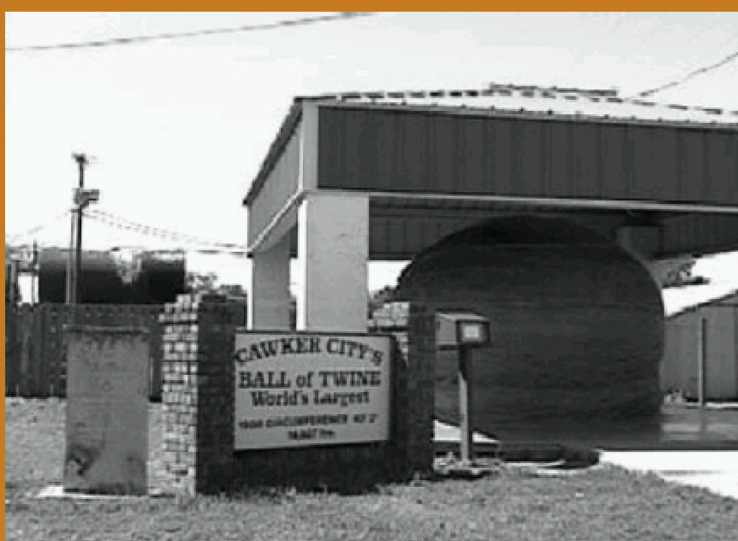
Cawker City's Ball of Twine was started in 1953.