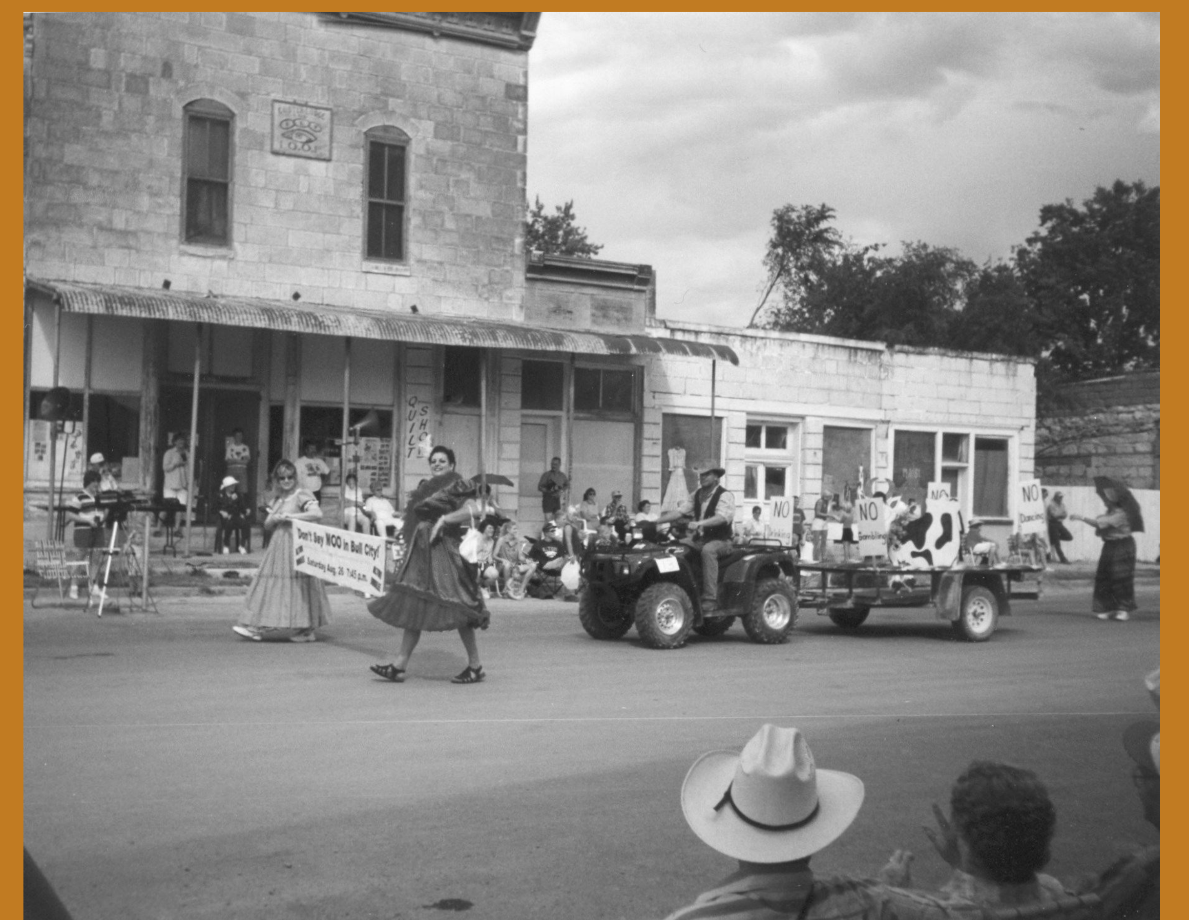
Local performers entice folks to come to the evening performance of the Bull City Opry during the annual Alton Jubilee Parade, one of the largest parades in northern Kansas, and held the 4th weekend of August.

Whether it's early spring, late fall, or early winter, come to Alton and enjoy a community celebration, always featuring food! On the first Saturday of December the Alton Chocolate Festival honors the chocolate-giant Russell Stover, an Alton native. In October the Alton United Methodist Church hosts a dinner to celebrate the harvest, and the annual Easter Breakfast is served after the Sunrise Pageant. The Bull City Community Foundation continues to sponsor a unique eating establishment in the old Bohemian Hall.