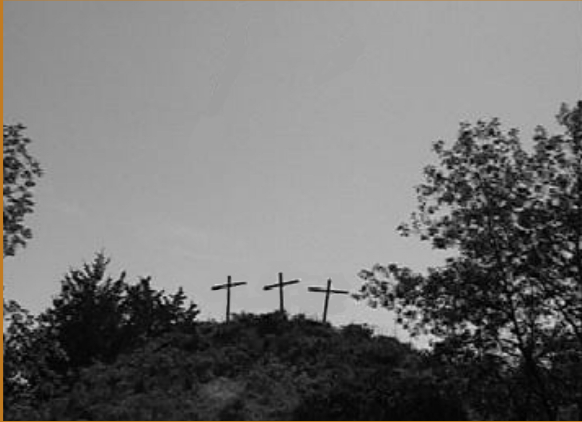
The annual Alton Easter Sunrise Service has long been a popular event held at the Alton Bluffs located a mile south of the town.