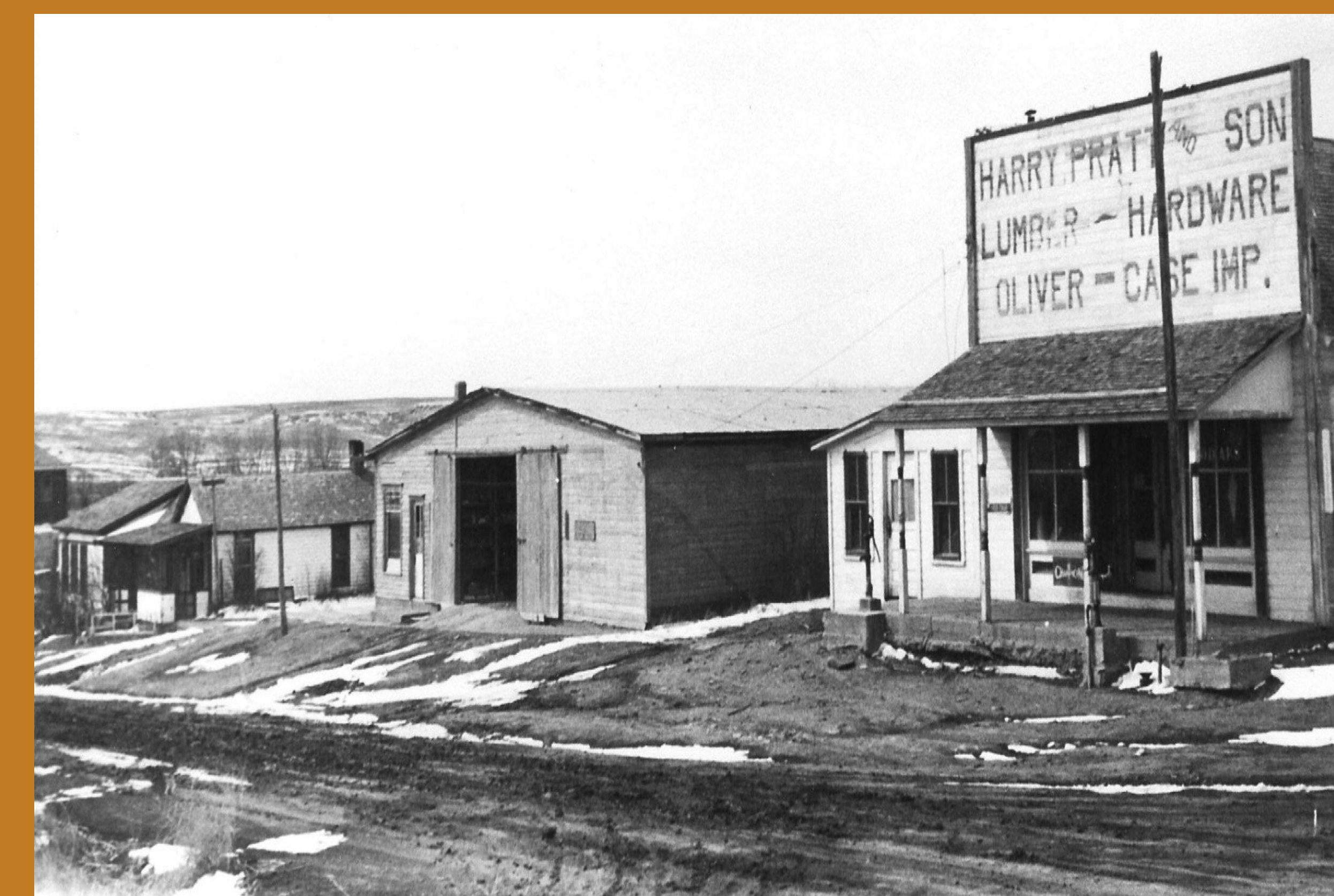
At one time downtown Studley was a thriving center of commerce.

Many activities are held annually to preserve and celebrate the homesteading tradition of Studley and the Cottonwood Ranch. The Annual Sheep Dog Trials is a Studley tradition that draws visitors from a far to test their dogs in a long time ranching tradition. The ranch is also host to many traveling exhibits, such as the showcase of boots. These exhibits allow visitors to the ranch to have a better understanding of life on the prairie.