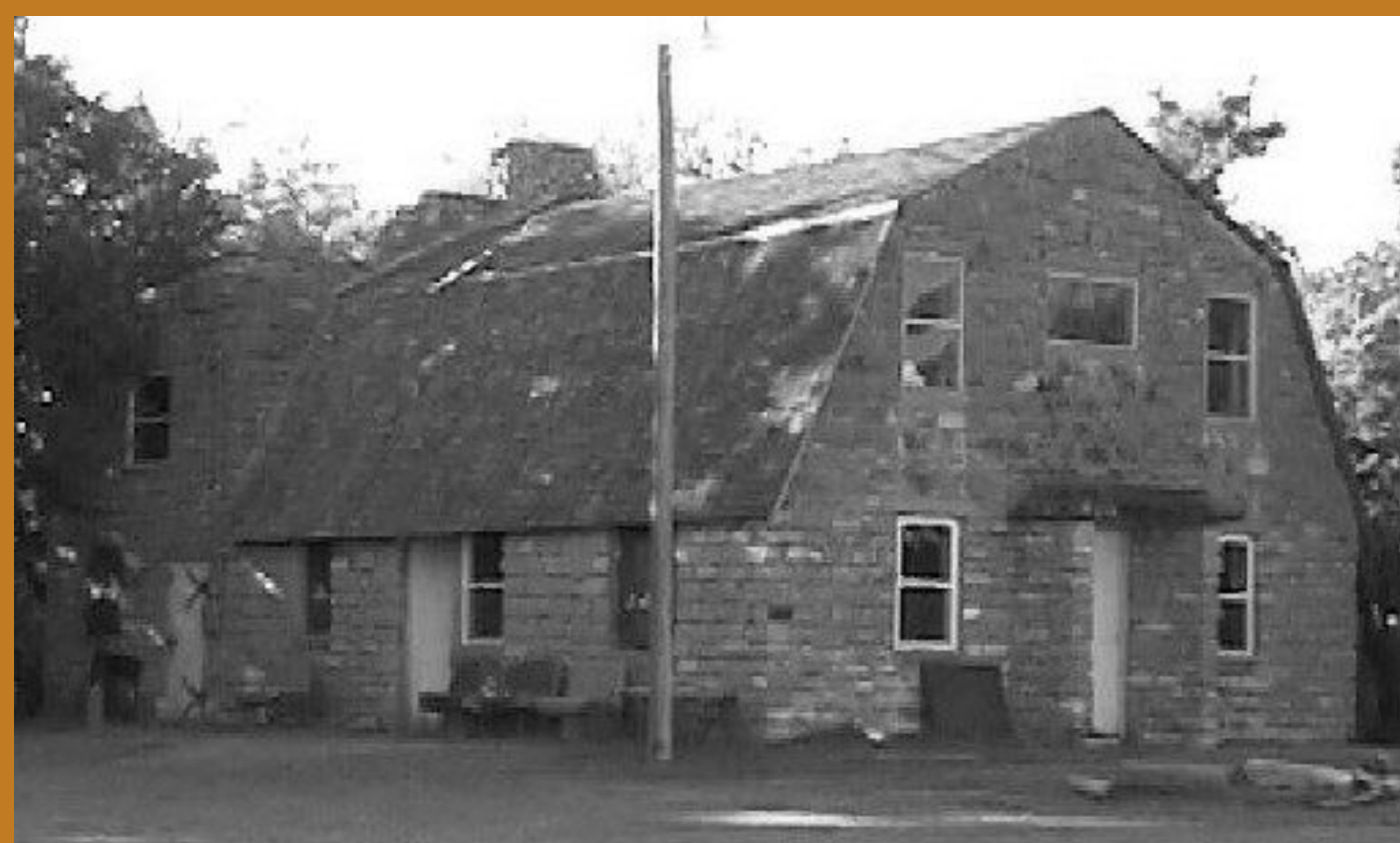
The native stone WPA Scout Cabin on West Main Street was built in 1938. It serves not only as the home of Osborne's Boy and Girl Scouts but also is available for community gatherings and events.

Artistic merit can be seen in the 1929 white marble column Old Settlers Monument and the 2000 granite-and-Black African marble obelisk Osborne County Veteran's Memorial, both located on Courthouse Square at 423 West Main Street. On the Osborne County Courthouse itself are unusual carvings of stylized sunflowers and a lion and Medusa, both symbols of justice.