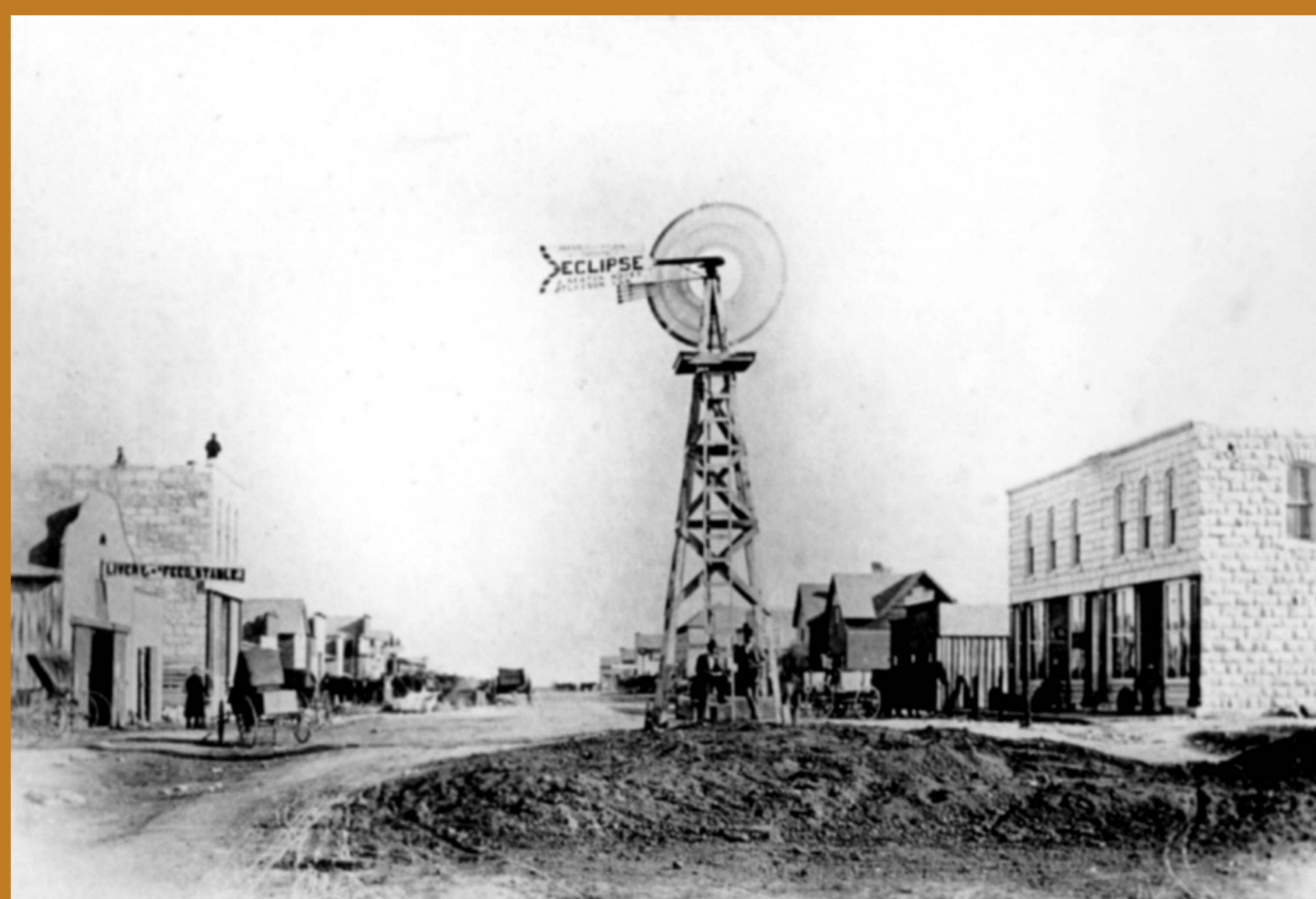
The Eclipse windmill stood above the town well at what is now the intersection of Second & Main Streets from 1872 until 1878. It served as a symbol of Osborne's community spirit and