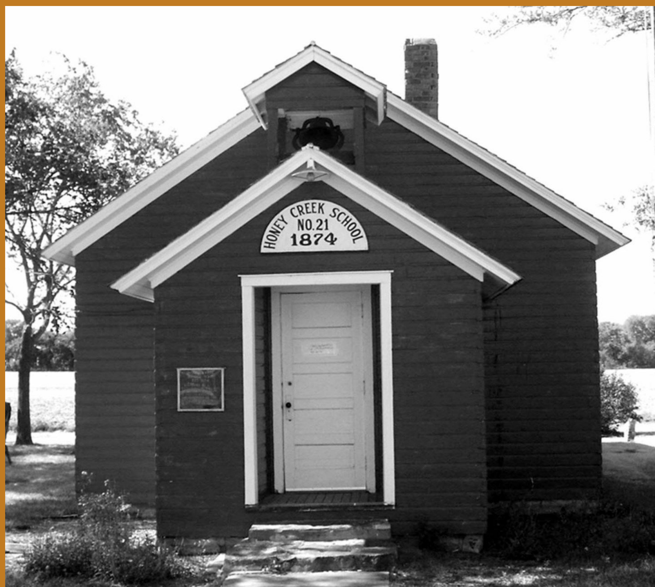
The historic Little Red Schoolhouse, located along U.S. Highway 24 at Beloit.

The Little Red Schoolhouse stands in the roadside park, along Highway 24 in north Beloit. This unusual schoolhouse was designed for the Bicentennial Celebration to fit the 19th Century style so people could learn about old-time schools in Mitchell County.