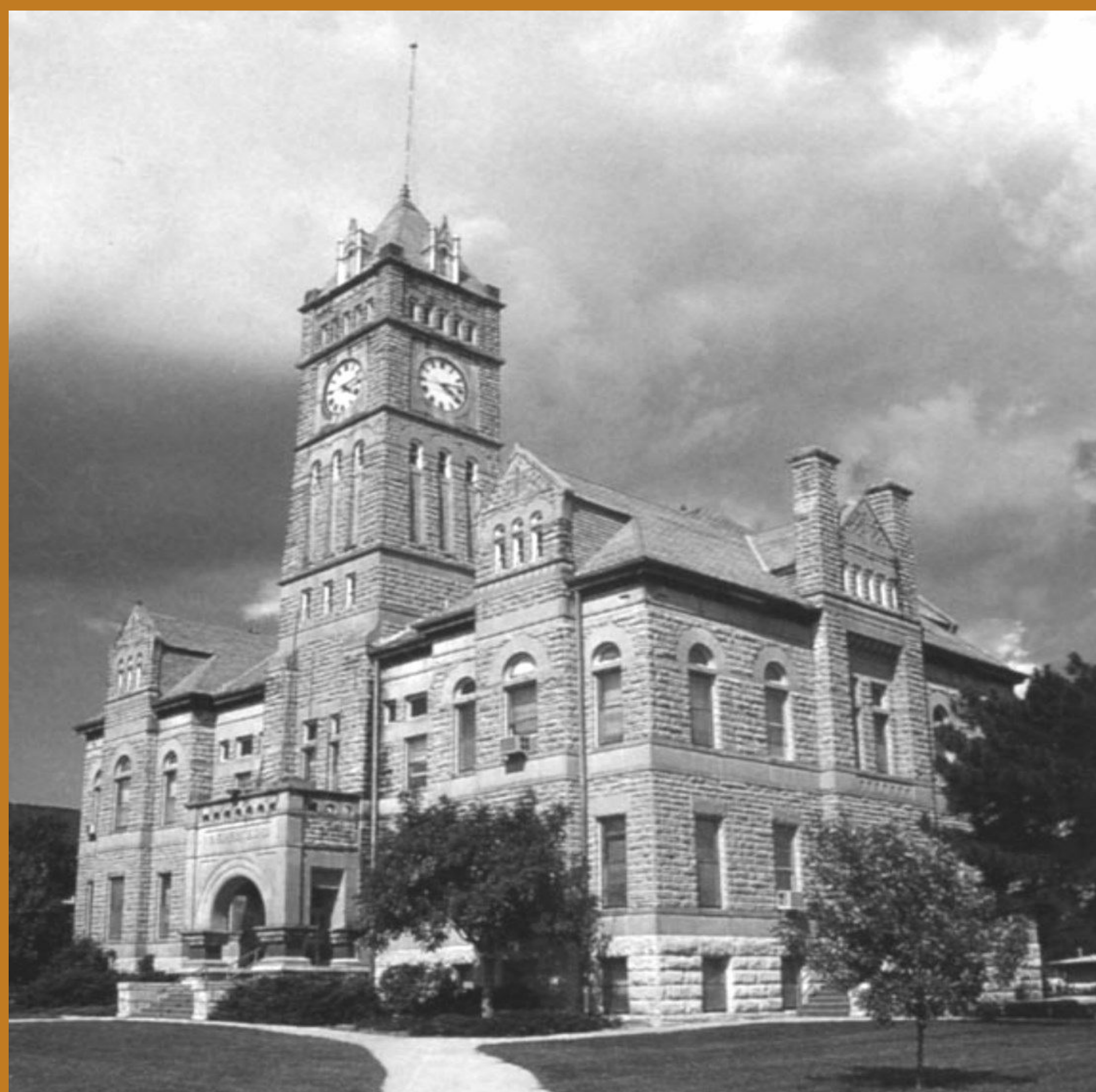
The 1901 Mitchell County Courthouse. James Holland, architect

As times have changed, the tastes of the rural public have also changed to include every type of cuisine. A variety of restaurants serve the public along Highway 24, from authentic Mexican and Italian, to local favorites that have endured the test of time. The local public still prefers meat entrees, with many products locally available from produce at the Summer Farmer's Market. Local restaurants are favorite places to meet for morning coffee or dinner in the evening.